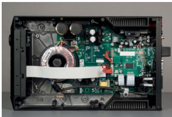
The device may be compact, but decent power is essential.

Next to the speaker outputs is a headphone jack. Putting the item from the rear of this idea quite original, but not without meaning. On the front is a button for activating the sound earmuffs. So you can connect headphones to the amplifier, and then only to decide whether to play or not. Can complain about the owners of larger collection of earmuffs, but I use to change the three pairs: Sennheiser Momentum On-Ear, Denonów Music Maniac AH-D340 and Jabr Revo. All are in one of the shells 3.5mm jack, so you can undo the cable with headphones instead of the amplifier.