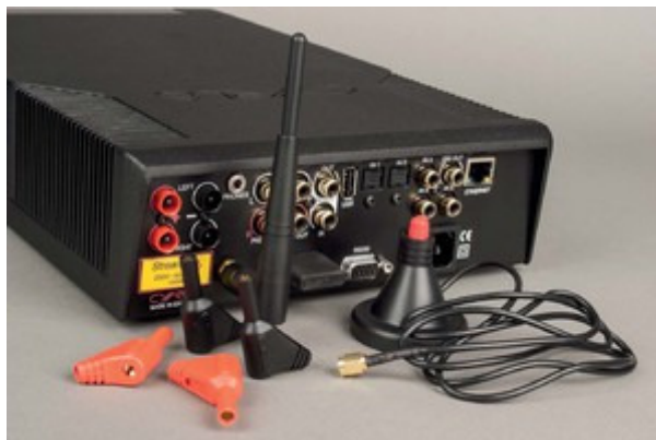
These are just some accessories from all over the boxes goodness.

This universal and versatile. We will not find in the tube spell, pushing aside the walls or resolution comparable to that which offer hi-end headphones, but in every music we get a bit of everything. I think I was in the right dosage of emotion lies the strength of this unit. Cyrus does not make mistakes. It does not add anything to the sound annoying. Therefore it works in every situation - not only as partners, but as he streamer.